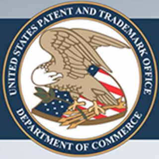
Illustration 3: Grace Period Under 35 U.S.C. 102 (b)(1)

Effective Filing Date (may be a domestic or foreign filing date)