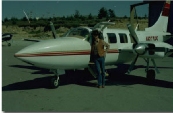
DigiBarn Computer Museum

Let the man who hasn't blown off a corporate giant to go flying cast the first stone.