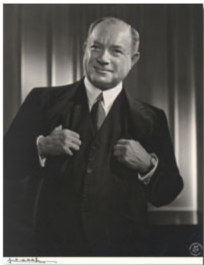
The David Sarnoff Library