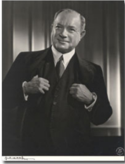
The David Sarnoff Library

change. And if it did, then he would at least make sure that RCA would be the one getting rich from it.