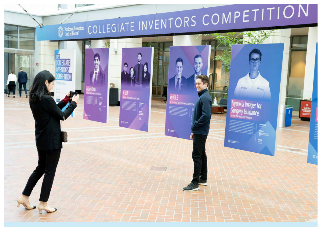
Students posing in front of their banners at the Collegiate Inventors Competition.

To encourage policies that promote innovation domestically, we will advocate across the U.S. government and in Congress for IP studies to identify best practices in the interest of the public good, including the impacts of IP on innovation, competition, employment, public health, and the U.S. economy. We recognize the need to assess and support policies that accurately reflect IP's role and impact in the global competitive landscape. Globally, we will continue to engage international partners, including the World Intellectual Property Organization, and with international standards bodies to promote pro-innovation and pro-IP policies. Further, we will substantiate our advocacy efforts with data that informs decision-making by conducting studies and evaluations to inform IP policies and practices.