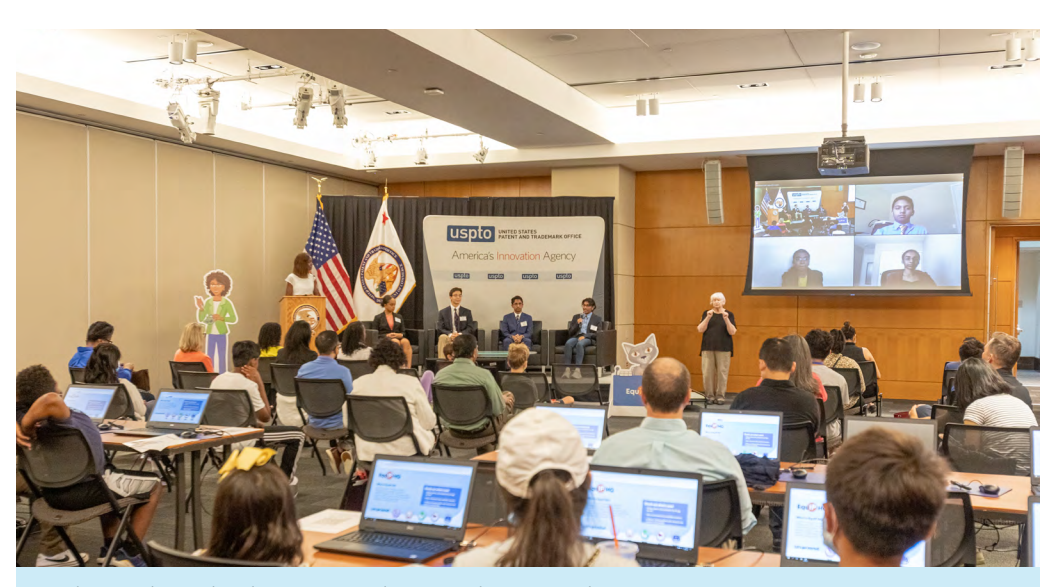
Students gather in the Clara Barton Auditorium to learn more about innovation using EquIP HQ, an invention education website with content tailored to each grade level, from kindergarten through high school.

To remain relevant and continue to deliver high-value services to our customers and our wider stakeholder base, we will apply lessons learned from ongoing customer experience (CX) efforts to further optimize our application processes for both patents and trademarks. Streamlining our processes, implementing more userfriendly tools, increasing our use of plain language, and expanding end-to-end electronic filing to more of our services will enable ease, efficiency, and confidence in our processes and their outcomes. We will increase access to information around patent and trademark services by offering multiple channels to access our resources and tools, in addition to using best practices for knowledge management. Our efforts to innovate for efficiency will extend from incoming applications through maintenance, trials, and appeals.