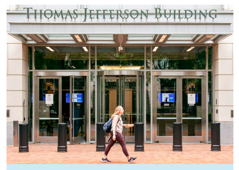
Passerby walks in front of the Jefferson building on the Alexandria campus.

It is also my key focus as Director of this agency, as reflected in our new USPTO mission statement, to: "Drive U.S. innovation, inclusive capitalism, and global competitiveness." Through a collaborative effort within the USPTO, which comprises over one quarter of the U.S. Department of Commerce's (DOC's) workforce, and based on valuable input from stakeholders, including employees, public advisory committee members, IP industry groups, and the broader public, we have