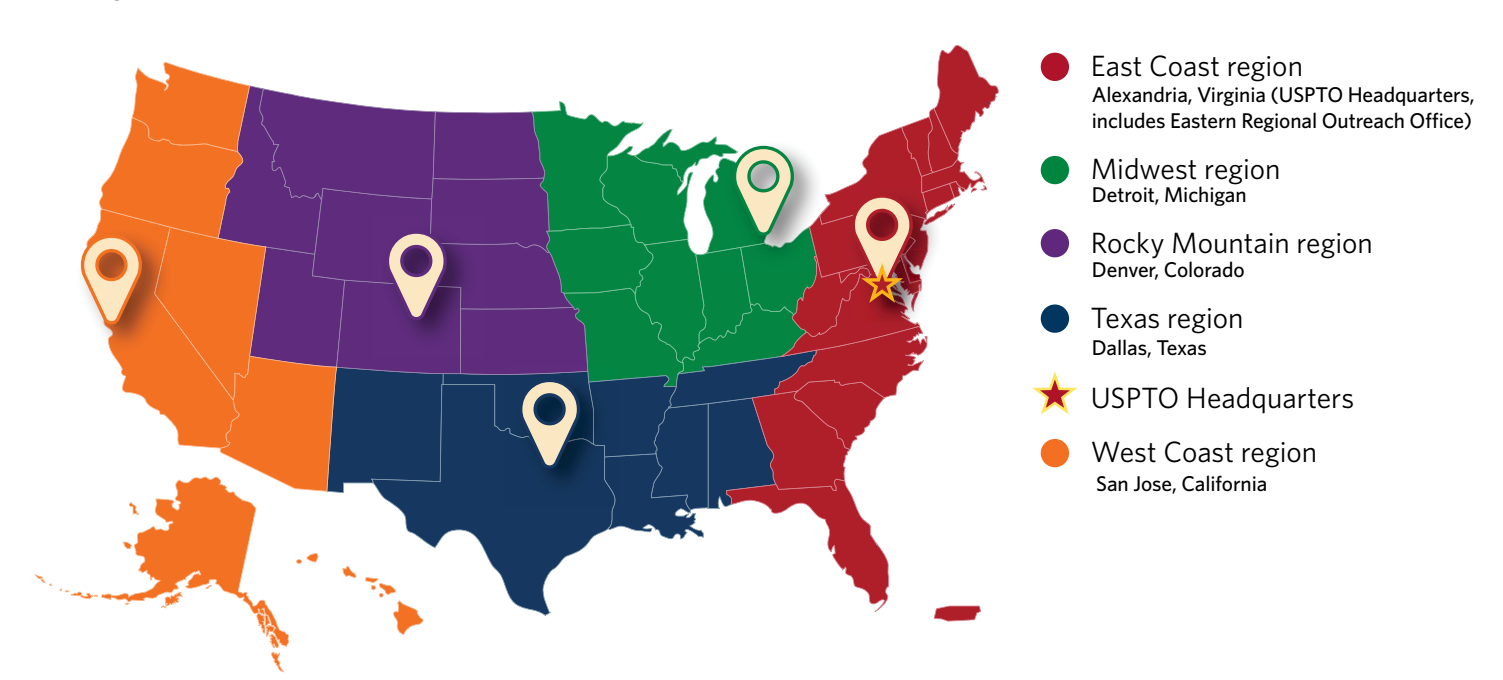
Figure 1: MAP OF THE USPTO HEADQUARTERS AND REGIONAL OFFICES