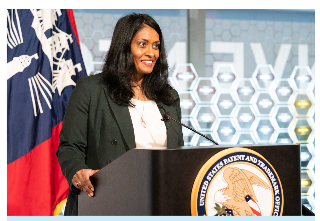
Vaishali Udupa, the USPTO Commissioner for Patents, delivers remarks at the National Inventors Hall of Fame Museum.

Our talented workforce of IP attorneys, policy experts, and IP operations experts will provide data, insights, and technical expertise to ensure that proposed laws, policies, and practices are grounded with a clear understanding of downstream impacts. We will also work closely with the judicial system at every level to support increased legal clarity and reliable IP rights.