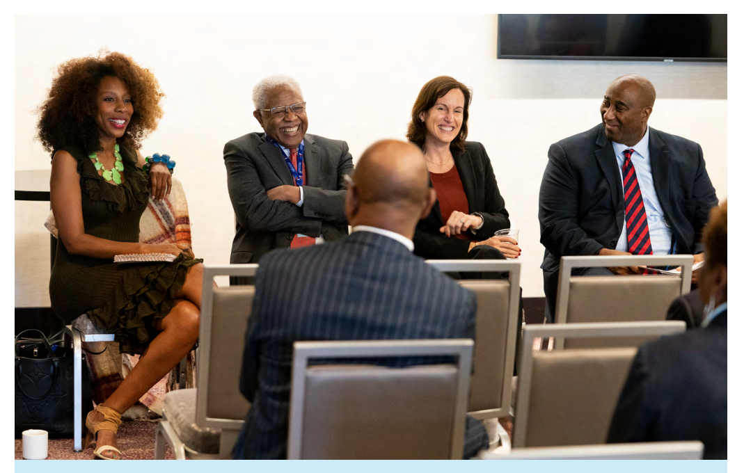
USPTO Deputy Director Derrick Brent (right) participates in a panel discussion.

A whole-of-government approach and public-private partnerships are critical to combatting domestic IP criminal activity, including piracy, counterfeiting, and theft of trade secrets. The USPTO collaborates with partners across the federal government, including DOC's OIG, DOJ, Department of Homeland Security, and Department of State to reduce IP crime. We will facilitate the frequent exchange of information across agencies and deliver training to raise awareness of common crimes and infringement activities. Additionally, we will empower businesses to participate in IP enforcement activities by delivering education and training through our public-private partnerships.