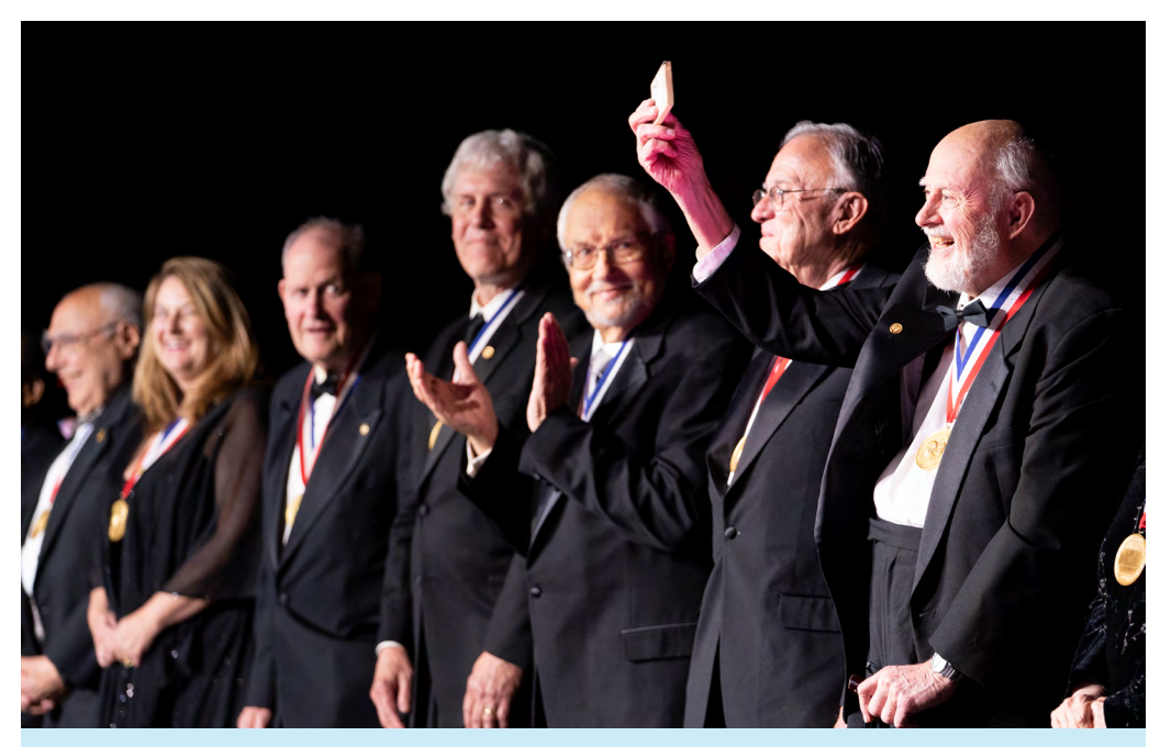
Members of the NIHF gather onstage during their induction ceremony.

The USPTO will identify policies, process changes, and technologies to improve patent pendency. Some of those efforts will focus on operational improvements to the patent examination process, including aligning the patent workforce with the incoming workload in the most efficient manner. Other efforts will target improvements to how applicants and other customers engage with the agency and navigate the prosecution process. We anticipate that our customers' needs will change as the innovation ecosystem expands. Empowering our customers to have options for how they engage with us will promote innovation.