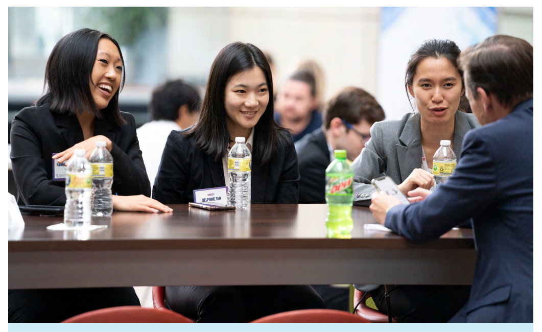
Student finalists in the 2022 Collegiate Inventors Competition, an annual competition for college and university students and their advisors, enjoy refreshments during a break.

KPI B: Frequency of use of register protection tools