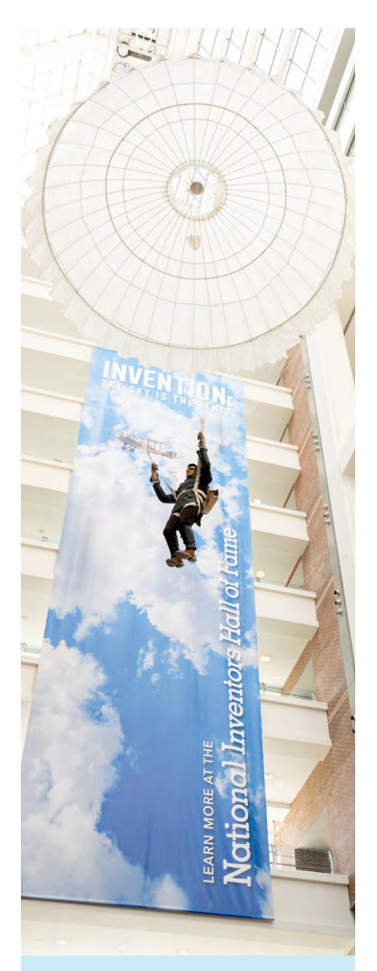
Floyd Smith, a pilot and inventor of the parachute, was inducted into the National Inventors Hall of Fame (NIHF) in 2022.

Given that IP rights are largely governed by individual countries, it is important for U.S. companies to protect their ideas and brands in the countries where they plan to do business. To accomplish this, the United States works with other governments to support strong and transparent IP rights. The USPTO helps lead Administration efforts to improve IP protection and enforcement around the world, including by providing education and capacity-building for foreign governments, representing the United States at international forums and organizations, concluding and implementing cooperative agreements with counterpart national IP offices, and supporting the U.S. Trade Representative in negotiating the IP provisions of U.S. trade agreements.