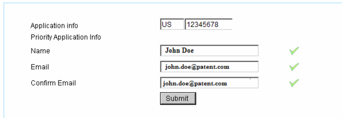
Figure 2: Applicant’s e-mail information for confirmation status notification