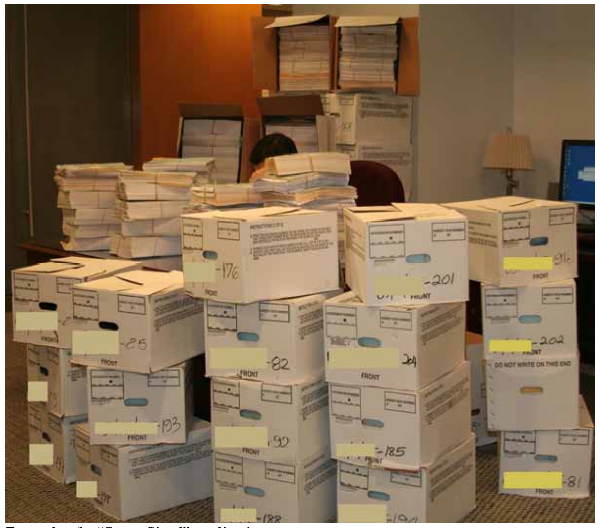
Example of a "Super Sized" application.

examiner's ability to timely analyze and consider the references, much less to craft a meaningful response. In such "super-sized" applications is it fair to the system and the public for any presumption be afforded to these "dumped" references?