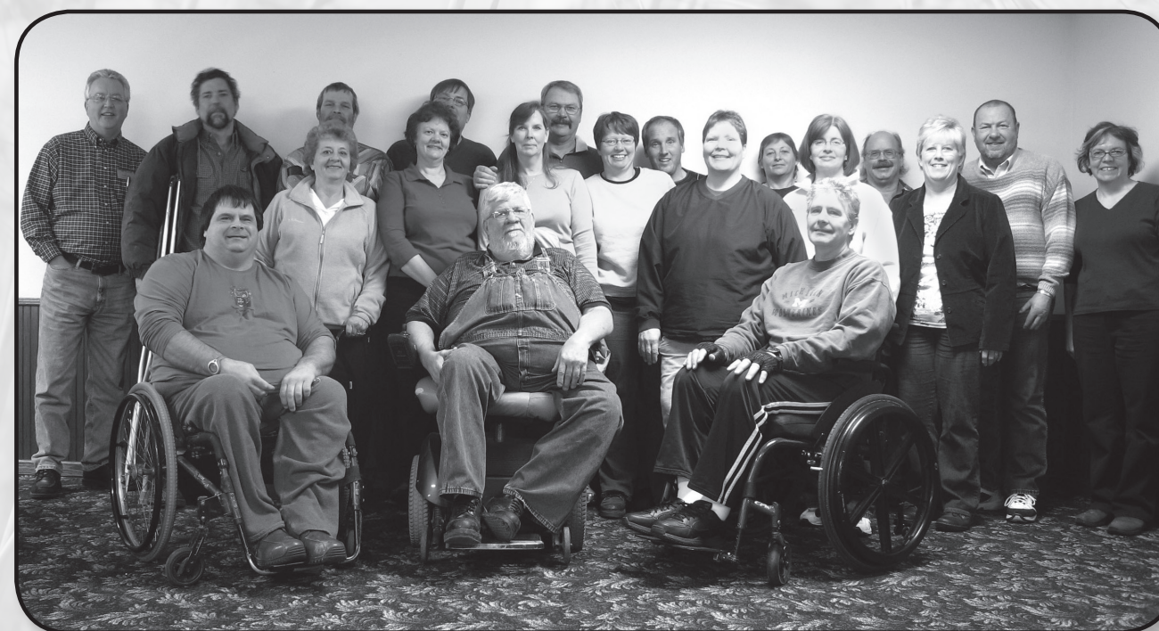
Presenters and attendees of the agricultural behavioral health training at the Victorian Inn.

The first day ended with an evening meal, giving the attendees the chance to socialize informally. The second day featured a Farm Café. Participants had the opportunity to further discuss behavioral health; sharing with and/or providing support to others regarding the behavioral health issues impacting their lives. Overall, the training was a great learning experience for everyone, including the Minnesota AgrAbility team.