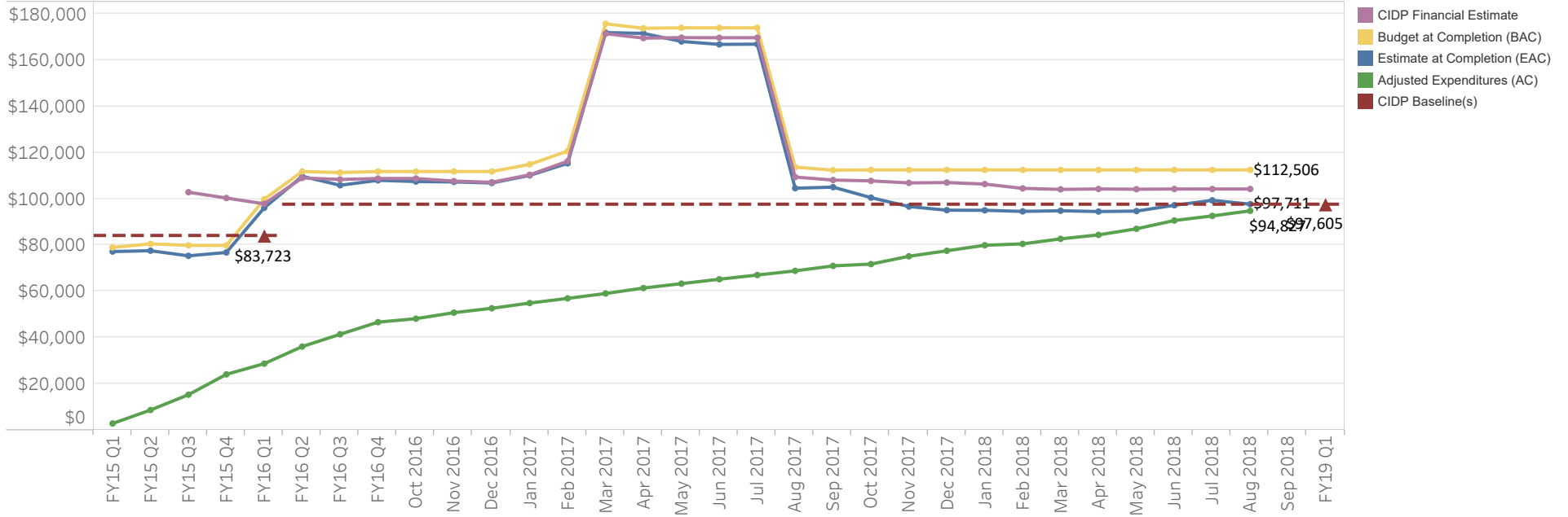
Chart 2 - Current Baseline by FY