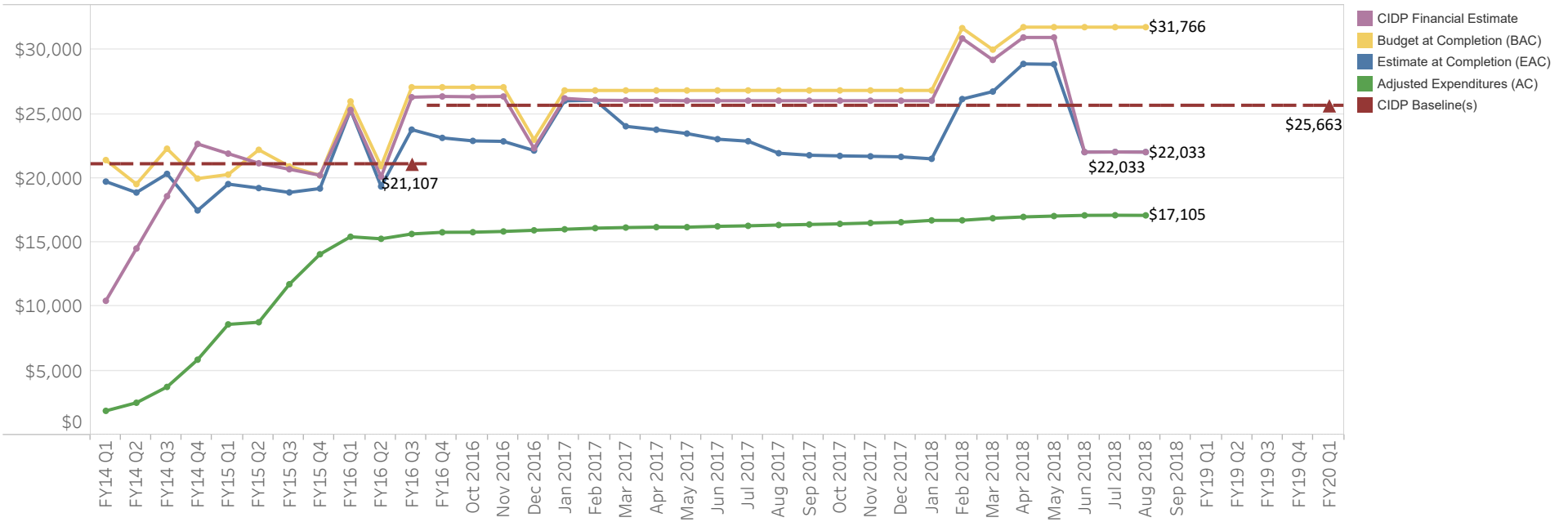
Chart 2 - Current Baseline by FY