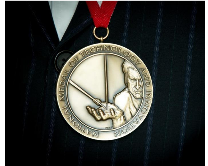
NMTI Medal.