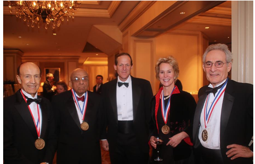
Gala dinner for NMTI Laureates.