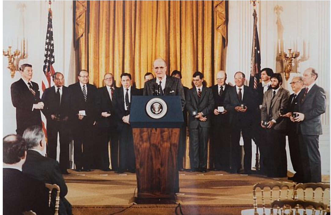
First class of National Medal of Technology Laureates, 1985.